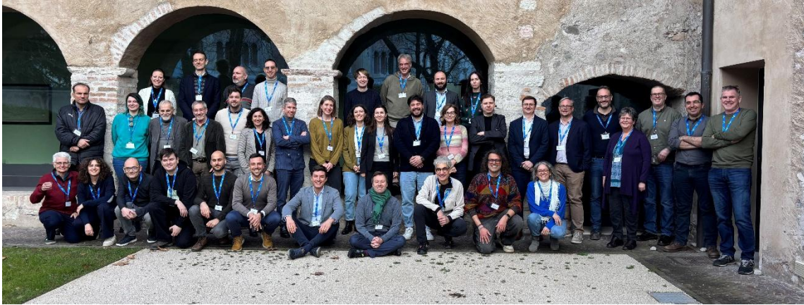
Consortium partners at the Kick-Off Meeting in Trento, Italy, 2025.